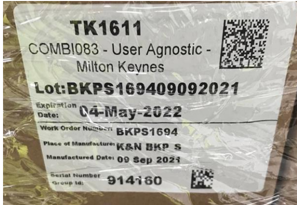
Label attached to outer carton